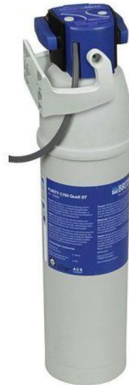
Cleaning time: up to 3 hours