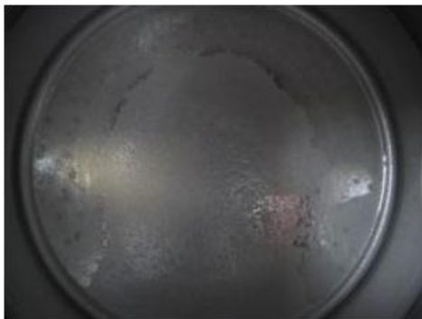
Mineral left over after boiling 20 L of SPECIAL Filter (Model : SP 520) Treated Water

To get a Special flavorful coffee, there must be mineral content in the water.