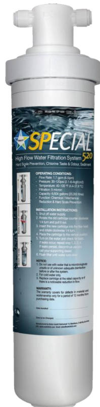
Cleaning time: Up to 15 minutes

The revolutionary hard scale Prevention media from Watch® named as FILTERSORB SP3 - which is used inside the SPECIAL™ Filter, will work with all water, regardless of minerals or hardness amount. Soft hard scale is easy to clean (see report).